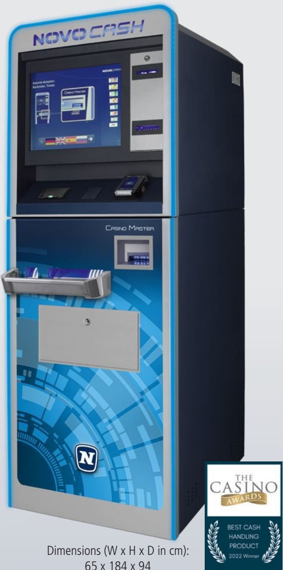
Dimensions (W x H x D in cm): 65 x 184 x 94

NOVO CASH CASINO MASTER HIGH CAPACITY SOLUTION