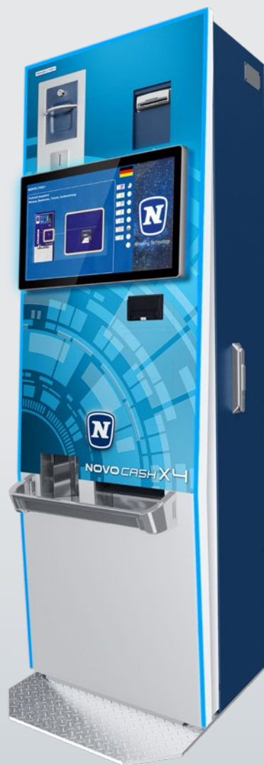
Dimensions (W x H x D in cm): 59 x 179 x 59