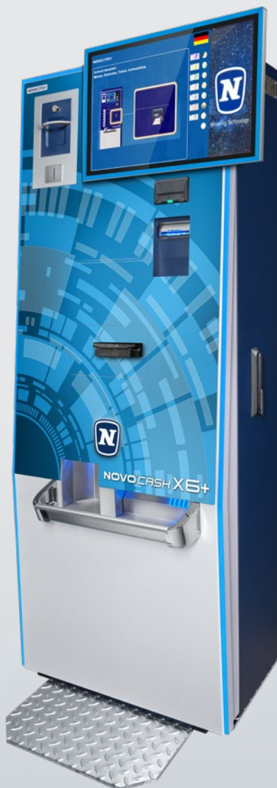
Dimensions (W x H x D in cm): 72 x 179 x 59

NOVO CASH X6+ PERFECT REDEMPTION MACHINE