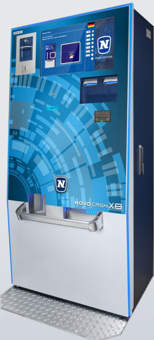
Dimensions (W x H x D in cm): 90 x 179 x 72

NOVO CASH X8 INNOVATIVE MONEY CHANGER AND REDEMPTION MACHINE