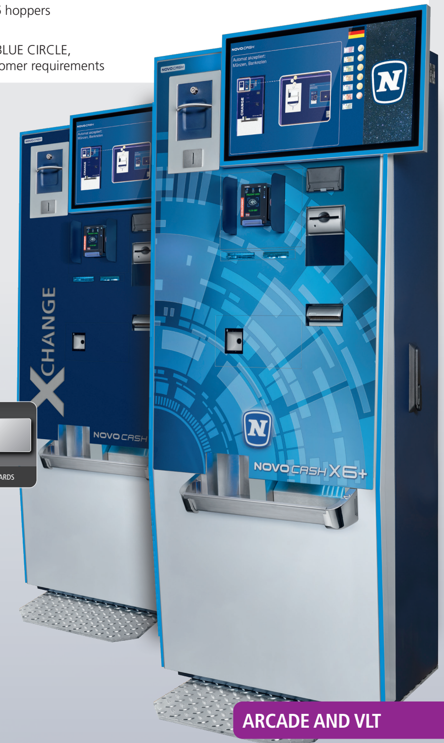
ARCADE AND VLT