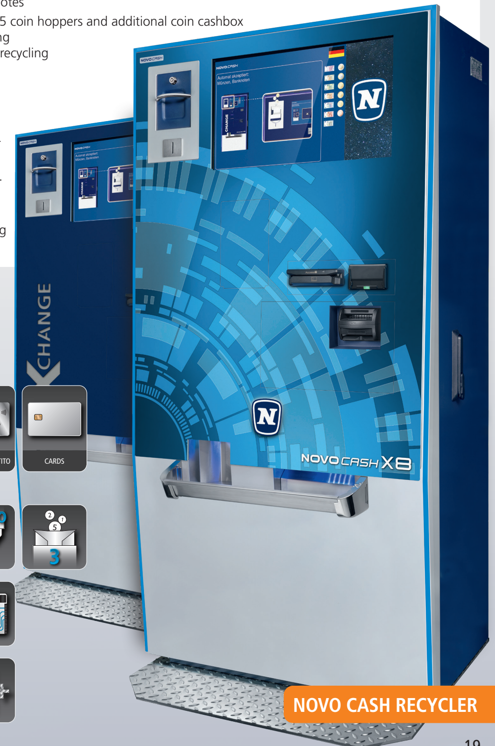
NOVO CASH RECYCLER